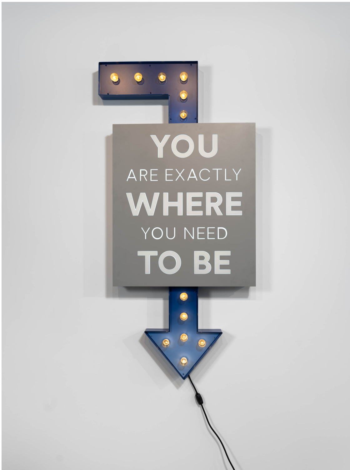
Charlie Hewitt, Where You Need to Be , aluminum, paint and vinyl with LED lights 72 x 36 x 5 ¼ inches