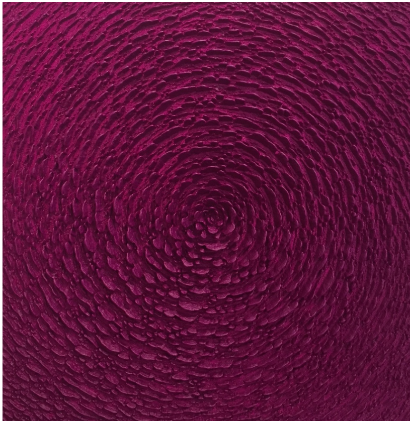
Martin Kline, Cobalt Violet Bloom , 2017, encaustic on panel 36 x 36 x 3 1/2 inches

For more information and/or high-res images, please contact Rachael Palacios, rachael@Heathergaudiofineart.com .