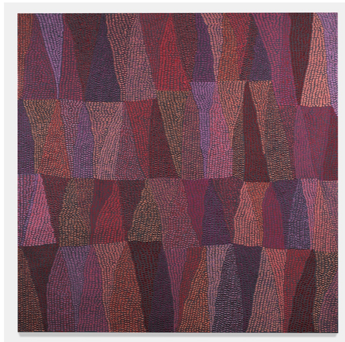
Madeleine Keesing, Untitled , 2014-15, oil on canvas 60 x 60 inches