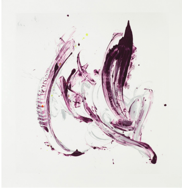
Jill Moser, Cycle X 22 , 2013, monoprint

66 Elm Street, New Canaan, CT 06840 p 203 801 9590 f 203 801 9580 heathergaudiofineart.com