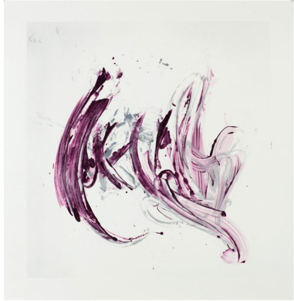
Jill Moser, Cycle X 6 , 2013, monoprint