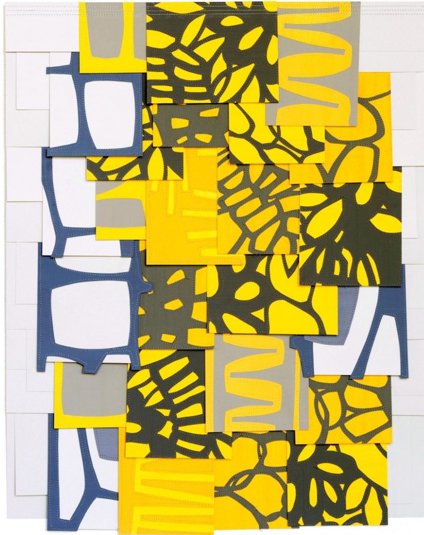
Raymond Saá, Untitled, 2017, Gouache collage on sewn paper, 28 x 22 inches

66 Elm Street, New Canaan, CT 06840 p 203 801 9590 f 203 801 9580 heathergaudiofineart.com