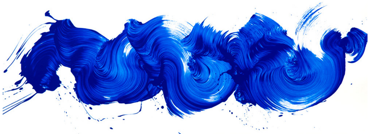
James Nares, I'm Blue , 2017, color screenprint, 28 x 75 inches

For more information and/or high-res images, please contact Rachael Palacios, rachael@Heathergaudiofineart.com .