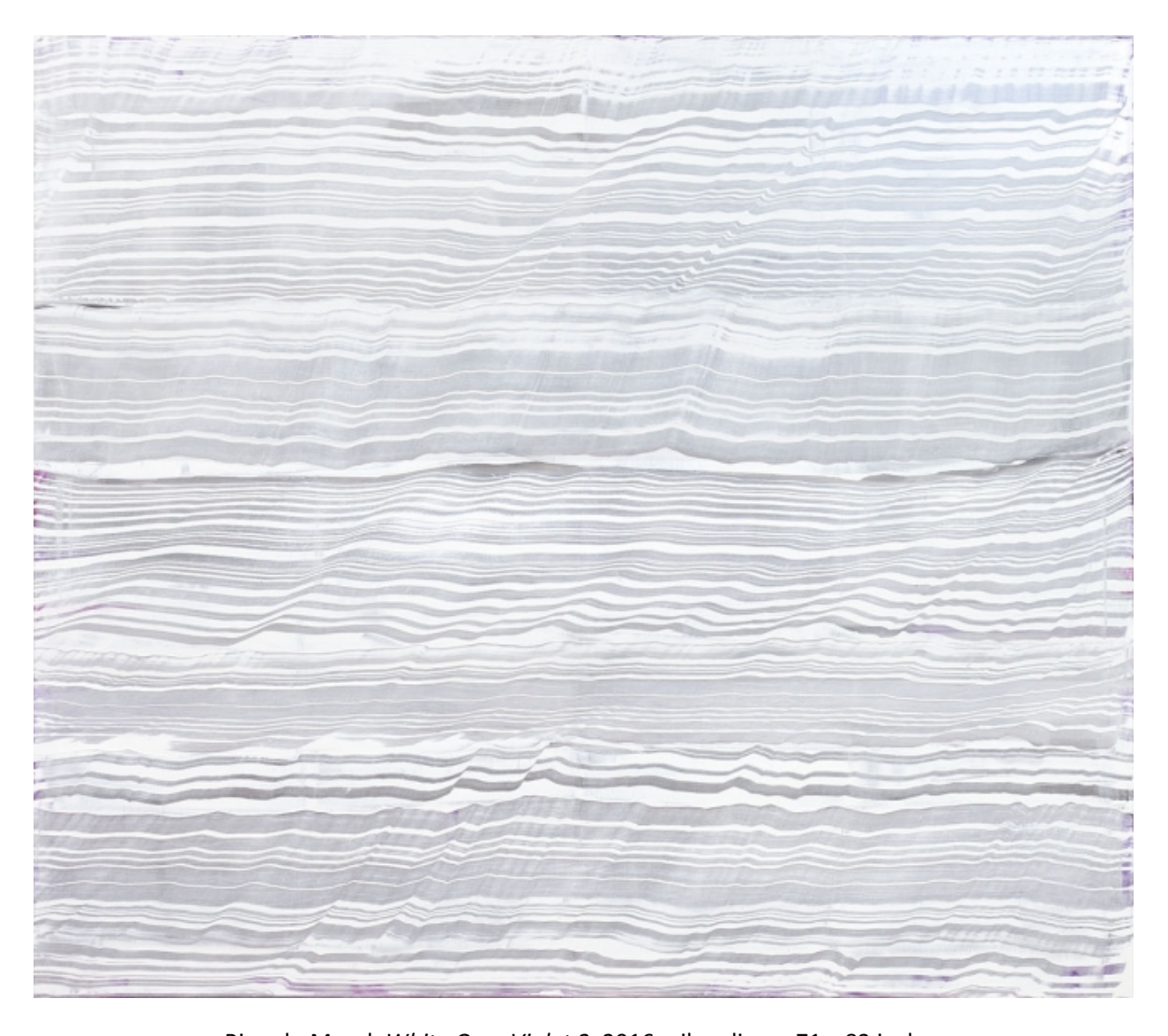
Ricardo Mazal, White Over Violet 2, 2016, oil on linen, 71 x 82 inches