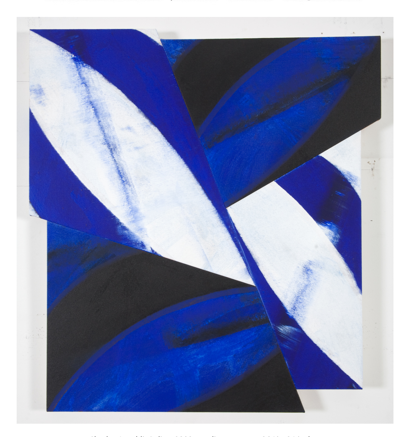
Charles Arnoldi, Byline , 2009, acrylic on canvas, 36 ¾ x 34 inches