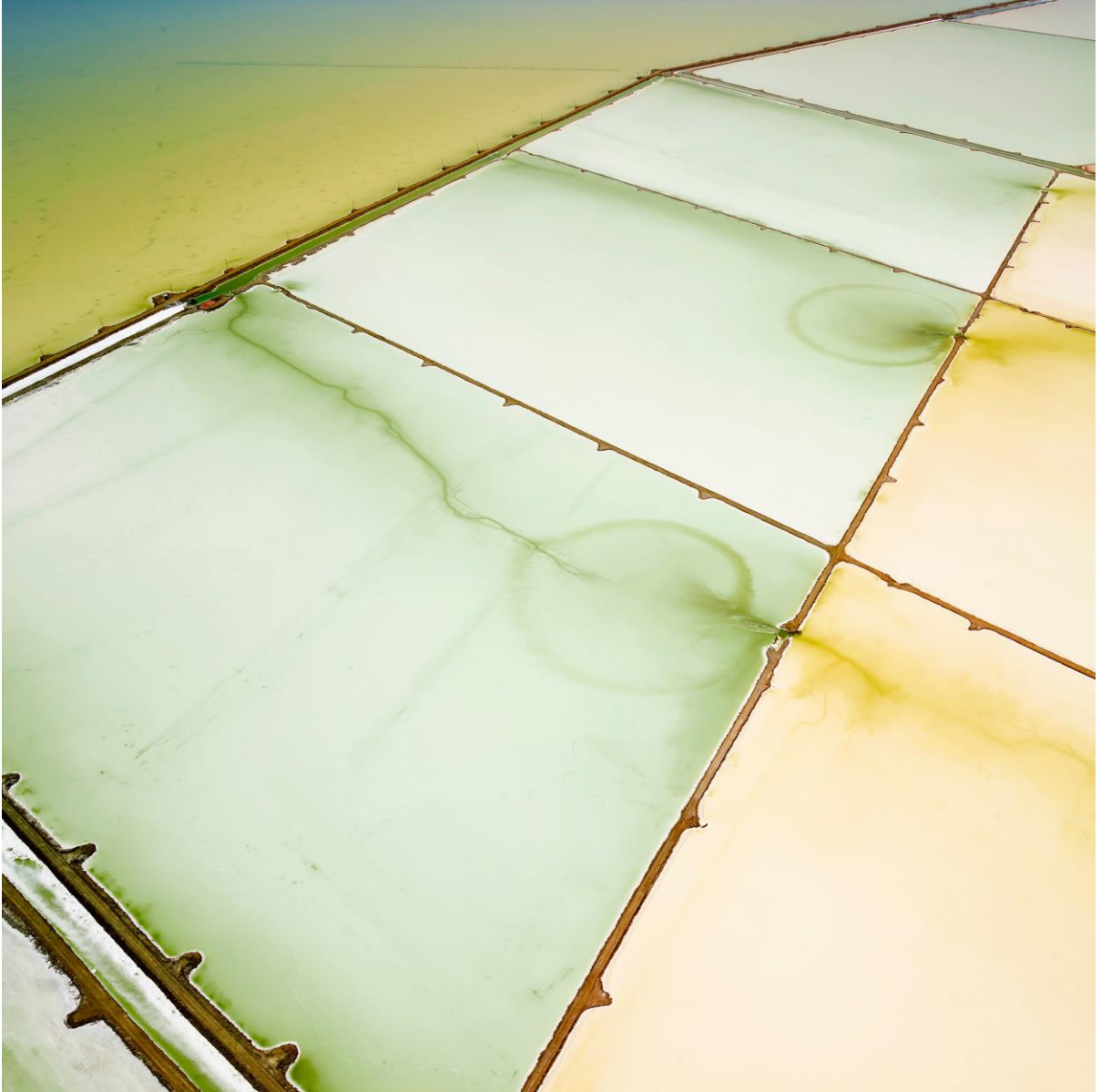
David Burdeny Saltern Study 05, Great Salt Lake, UT, 2015 Archival pigment print 44 x 44 inches